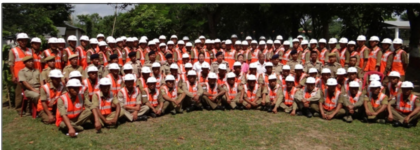
First batch of Village Guards, SDRF Training, CTI, Dimapur