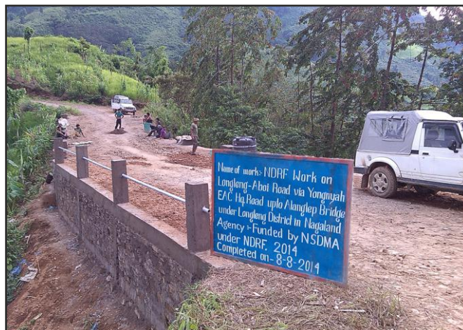
Work in Progress at Aboi road under NDRF