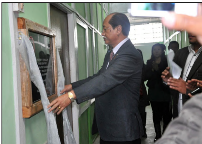
Inauguration of the SEOC by the former chief minister Shri Neiphiu Rio, old secretariat complex