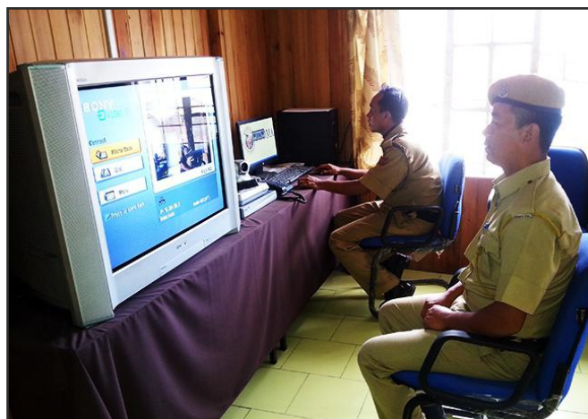
Nagaland State Emergency Operation Centre