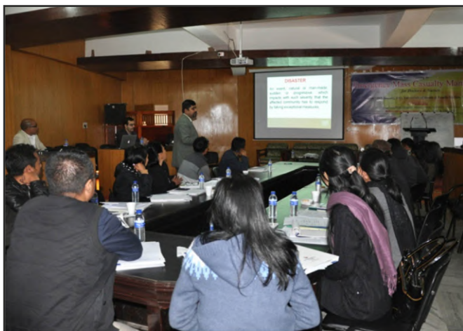
Emergency mass casualty in progress