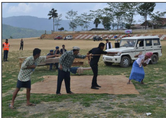
Dreamz Unlimited performing in Phek local ground