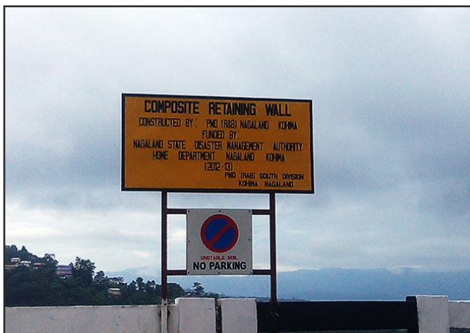
Landslide restoration by Composite retaining wall at D.Block, Kohima