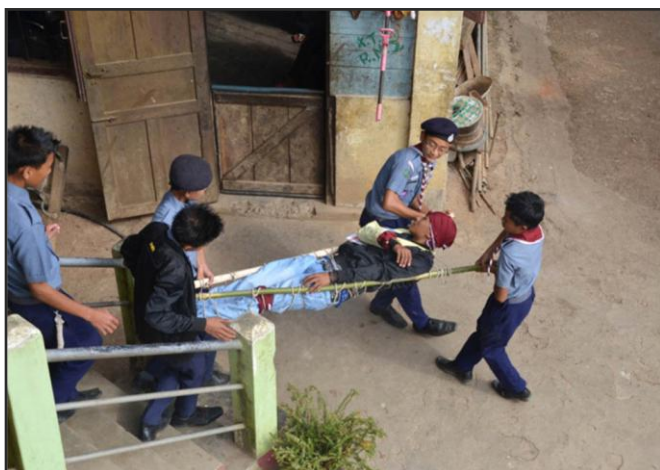
Mock exercise in Kiphire november 2013