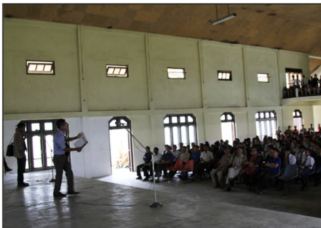
Dreamz Unlimited performing in Tuensang town hall