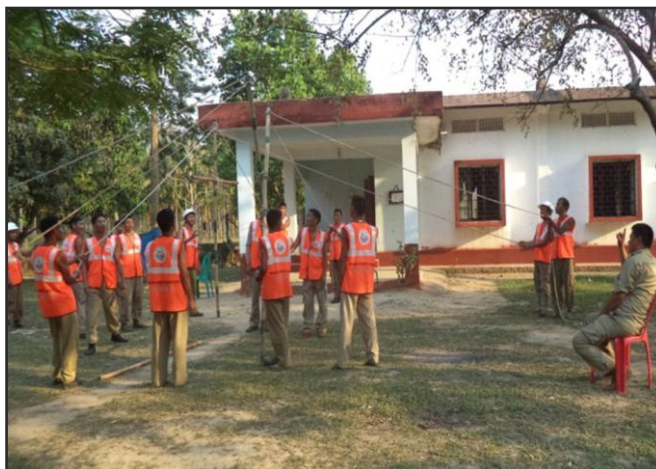
Practical class in progress for village guards