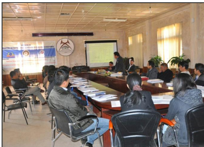
Rapid visual screening training in progress