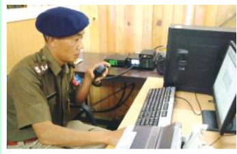
SEOC Control room

State Emergency Operation Centre (SEOC) and District Emergency Operation Centre (DEOC) shall be activated pre and during the NEPEX.