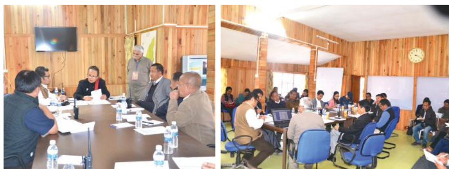
Mock IRS Activation at SEOC

NEPEX will be organized annually during different seasons of the year to acclimatize and build resilience to different extreme weather throughout the year.